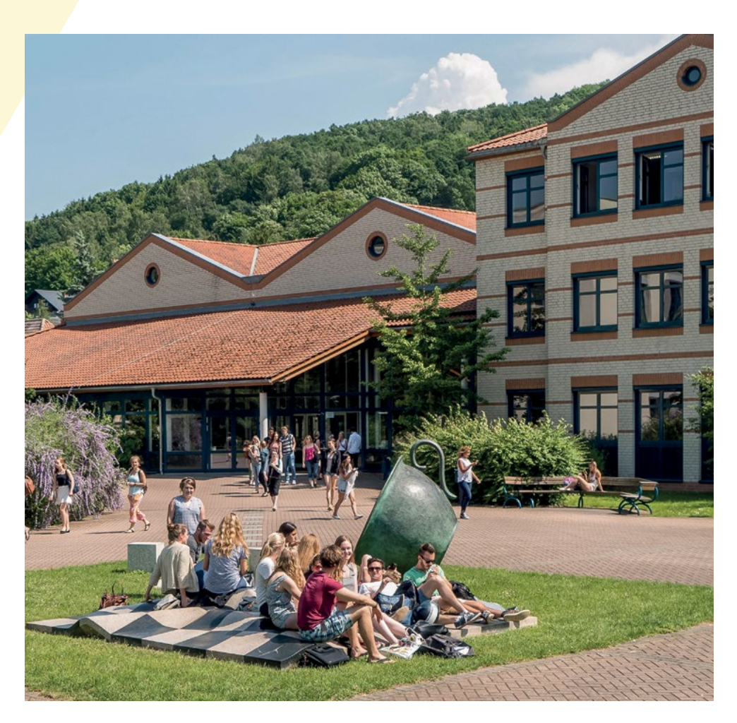
Coverphoto: Campus Wernigerode